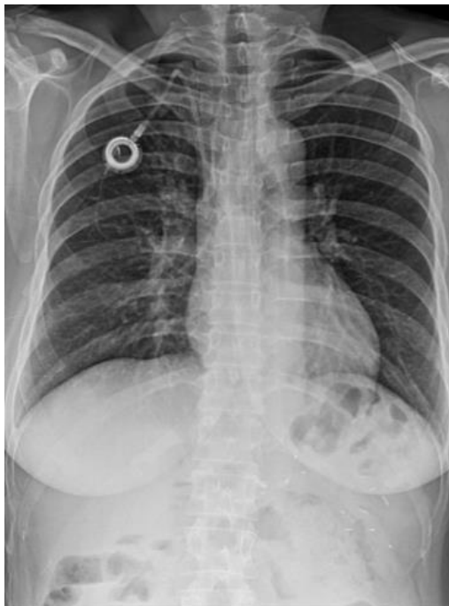
(a) Patient's chest X-ray; failed to find Levin tube